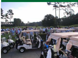
2006 Charity Challenge.

It's time once again for our annual charity golf tournament. As of this writing we have 28 teams and 20 hole sponsors. Since we can field a maximum of 54 teams and last year sold 49 hole sponsors we clearly still have a long way to go. There are many